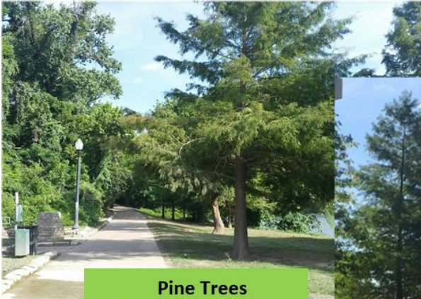
Pine Trees - Option to light pine trees similar in height throughout the trail